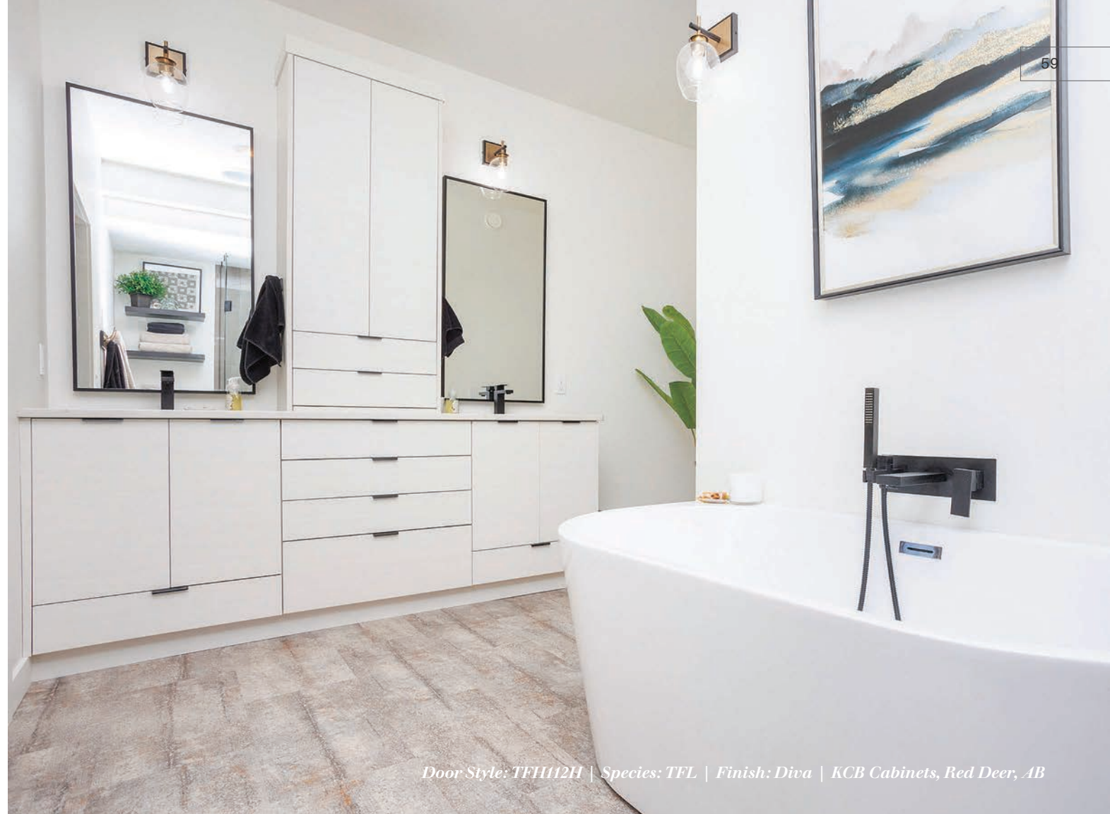
Door Style: TFH112H | Species: TFL | Finish: Diva | KCB Cabinets, Red Deer, AB