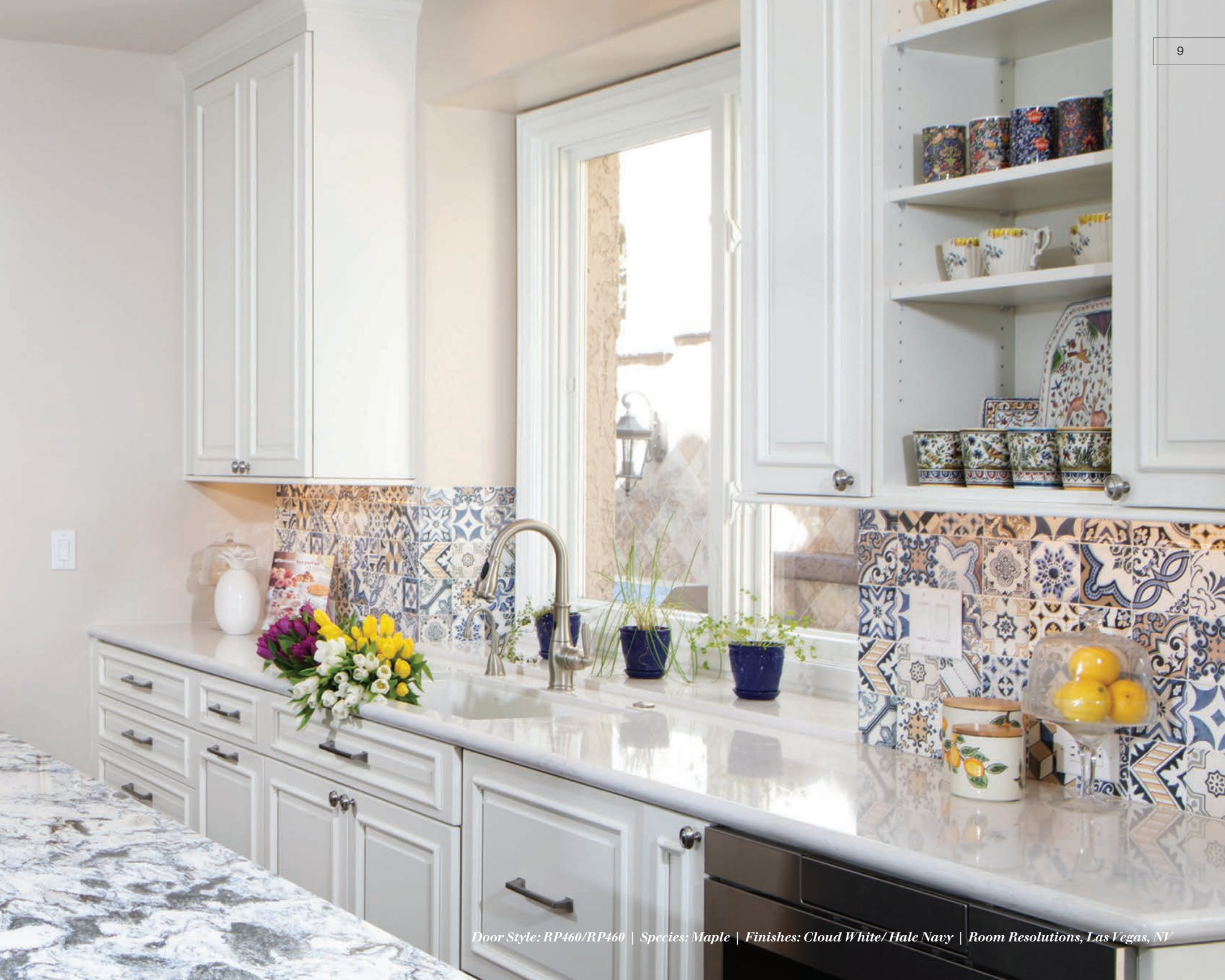
Door Style: RP460/RP460 | Species: Maple | Finishes: Cloud White/Hale Navy | Room Resolutions, Las Vegas, NV