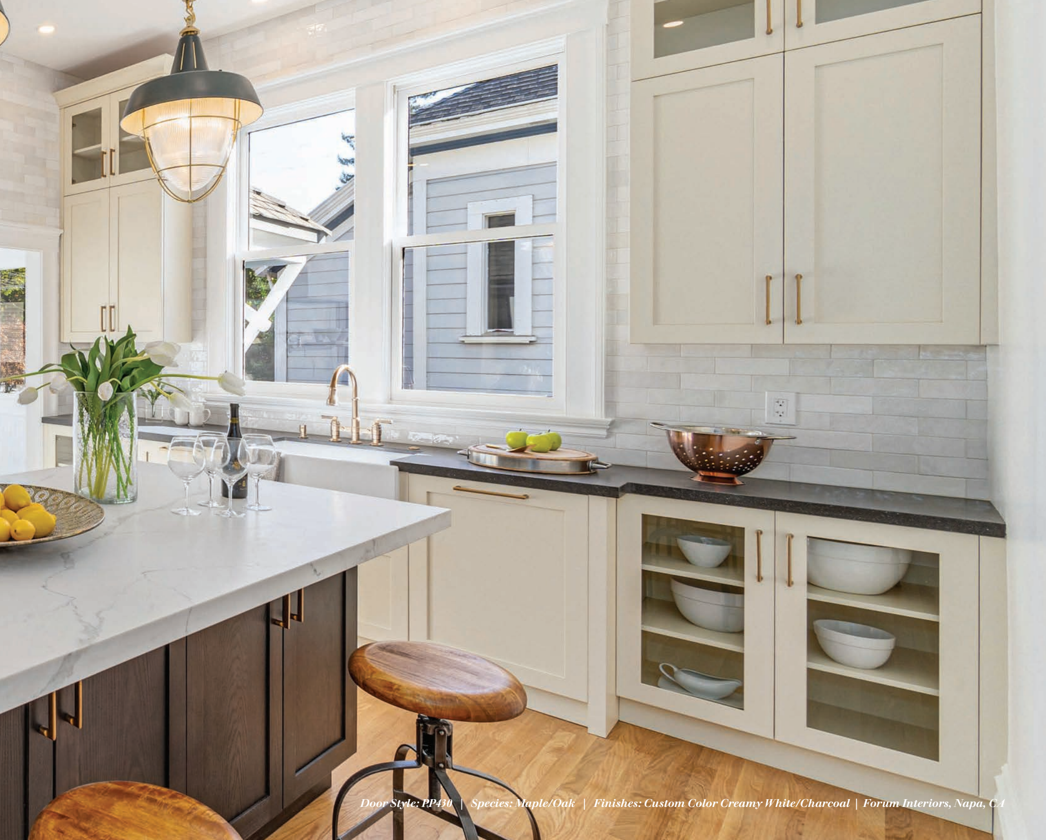
Door Style: PP430 | Species: Maple/Oak | Finishes: Custom Color Creamy White/Charcoal | Forum Interiors, Napa, CA