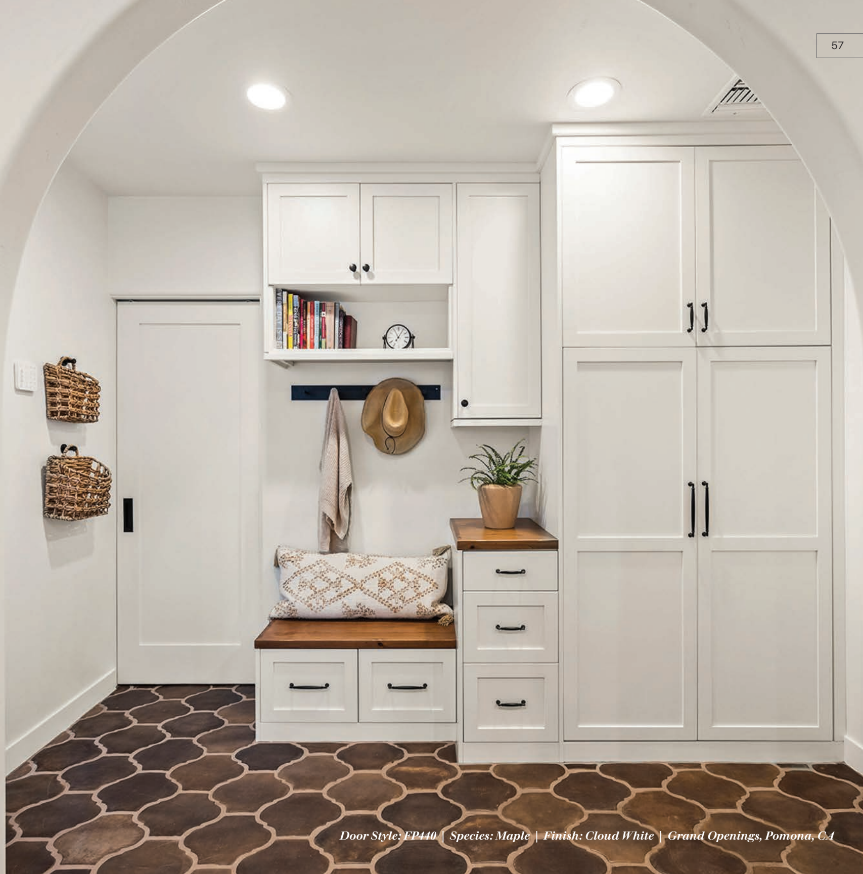
Door Style: EP440 | Species: Maple | Finish: Cloud White | Grand Openings, Pomona, CA