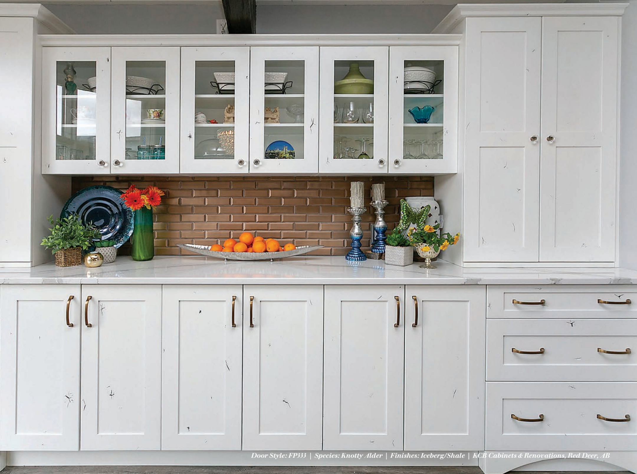
Door Style: FP333 | Species: Knotty Alder | Finishes: Iceberg/Shale | KCB Cabinets & Renovations, Red Deer, AB