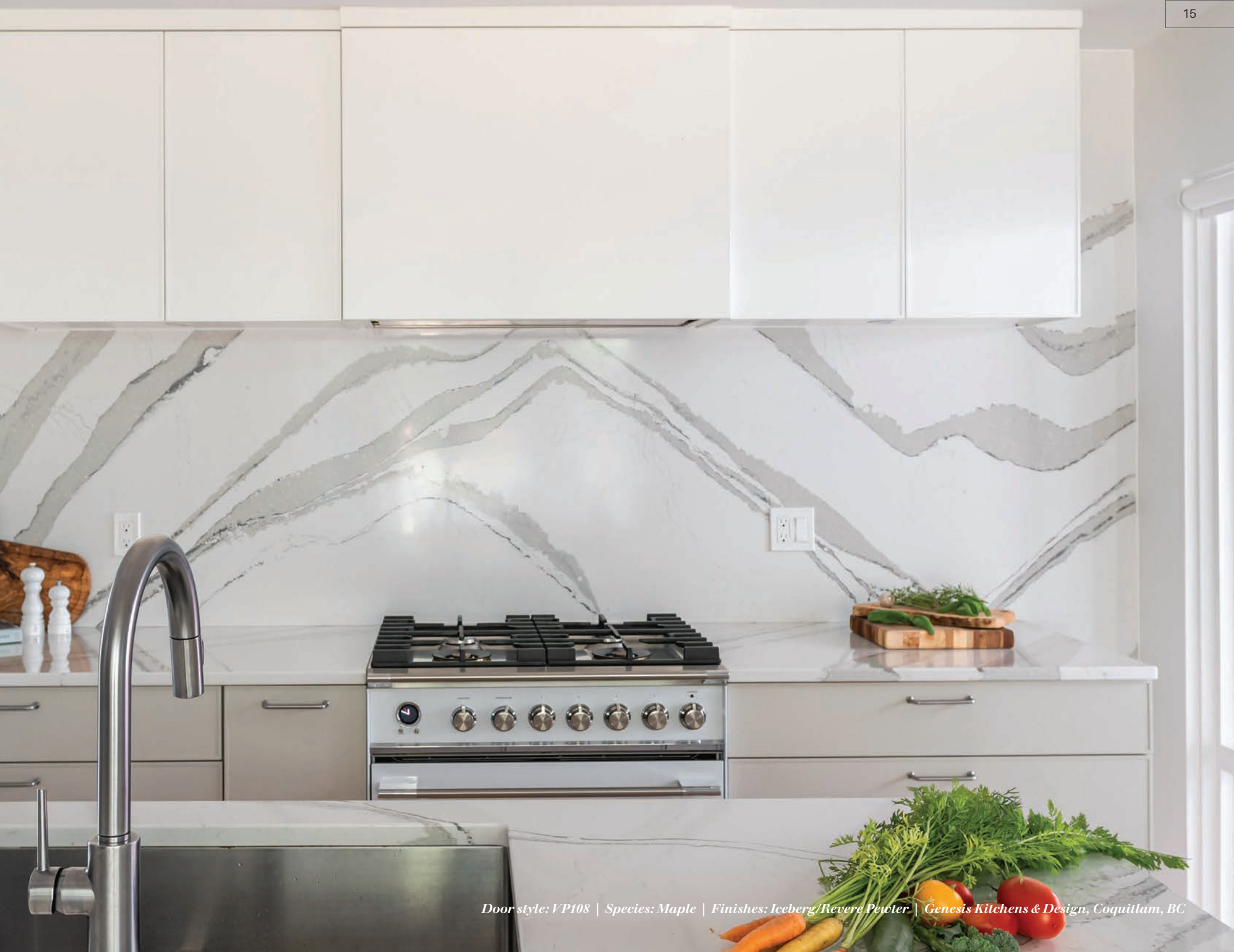
Door style: VP108 | Species: Maple | Finishes: Iceberg/Revere Pewter | Genesis Kitchens & Design, Coquitlam, BC